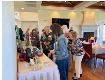
Attendees peruse the raffle items while also greeting longtime friends.